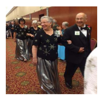
Our last walk before we are in the East!