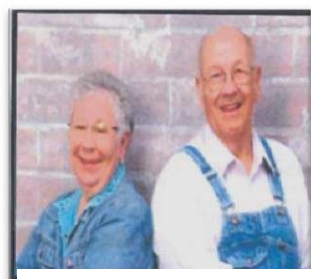
Think we might make good farmers?