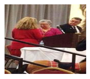
This is Official! I got my Pin!