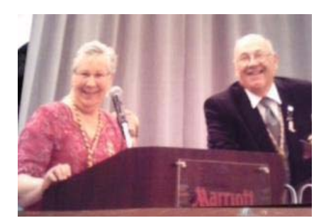
We are on our way to have a nice year!