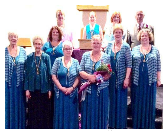
Franklin Chapter Officers