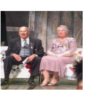
Relaxing before our Reception!