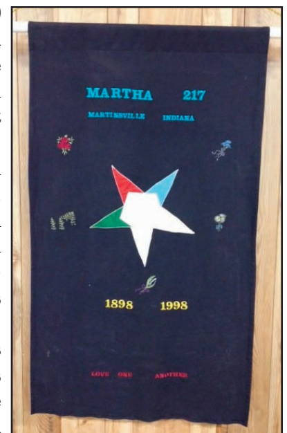
Wall hanging made for the 100 anniversary of the chapter