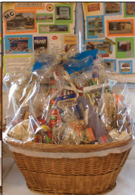
District #17 Basket