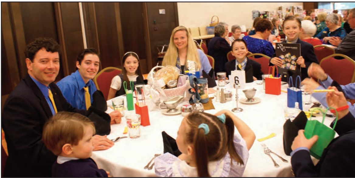
The Reen Family Singers

An invitation was given by Michigan for the next Multi State on August 16, 2014 at Lansing Center in Lansing, MI.