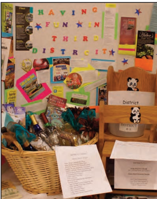
District #3 Basket