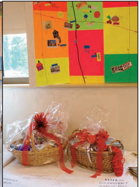
District #19 Display